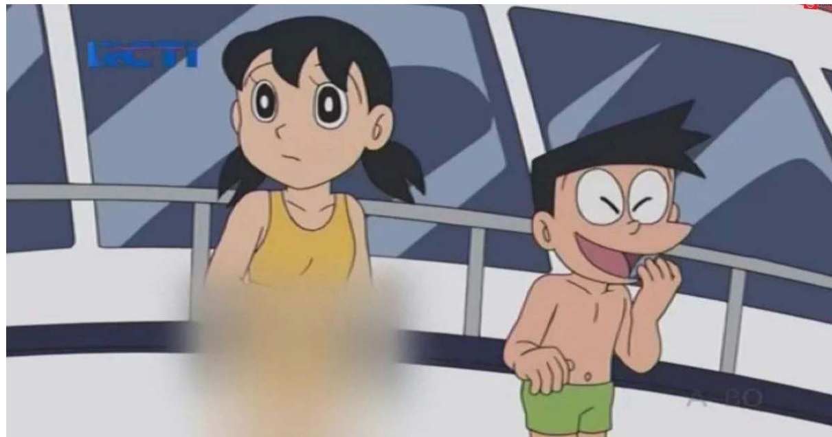
Fig 2. Screen capture of TV censorship on Doraemon cartoon, 2015.

Transaction (ITE) Law, and the Anti-Pornography law, which gave the Indonesian government authority to prosecute against the dissemination of any content they considered “negative” or “culturally inappropriate,”—terms so broad that it includes everything from terrorism to defamation and nudity (Freedom House, 2017). Furthermore, the 2008 bill presents a bafflingly loose definition of what constitutes pornography, “to the point of criminalizing actions such as the kissing of lips in public, the display of sensual parts of the body, or any form of art perceived to be explicit” (OONI, 2017, para. 40). Here we see how easily the censorship of media in Indonesia becomes a censorship on behaviour.